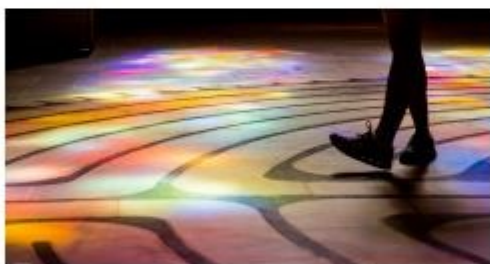
Walking a labyrinth