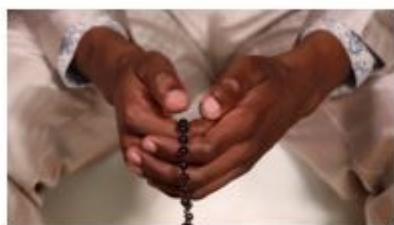
Using prayer beads.

Please join us at St. Mark's Church on Friday, October 18th in our next Way of Love program, focusing on prayer. We will learn and practice: